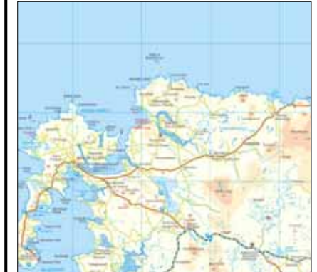
Proposed Development Layout